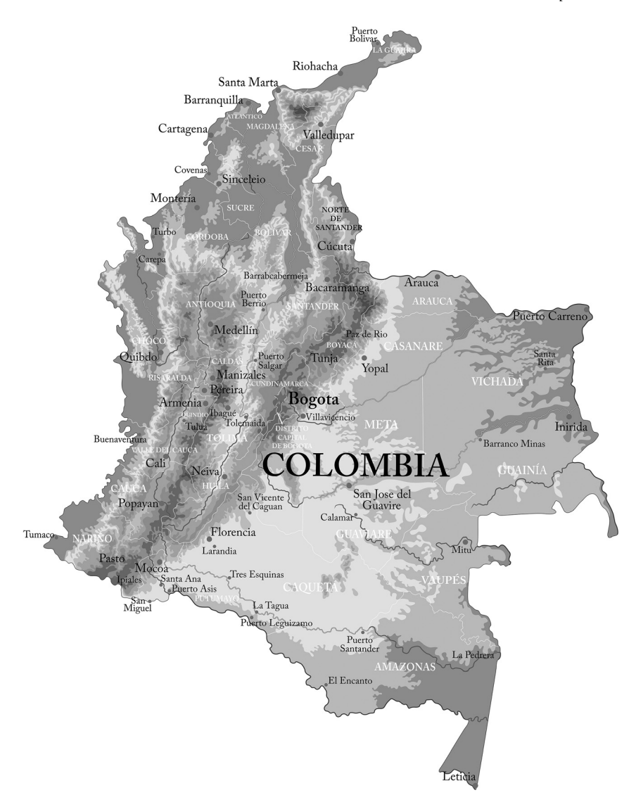
Map 0.2 Physical map of Colombia